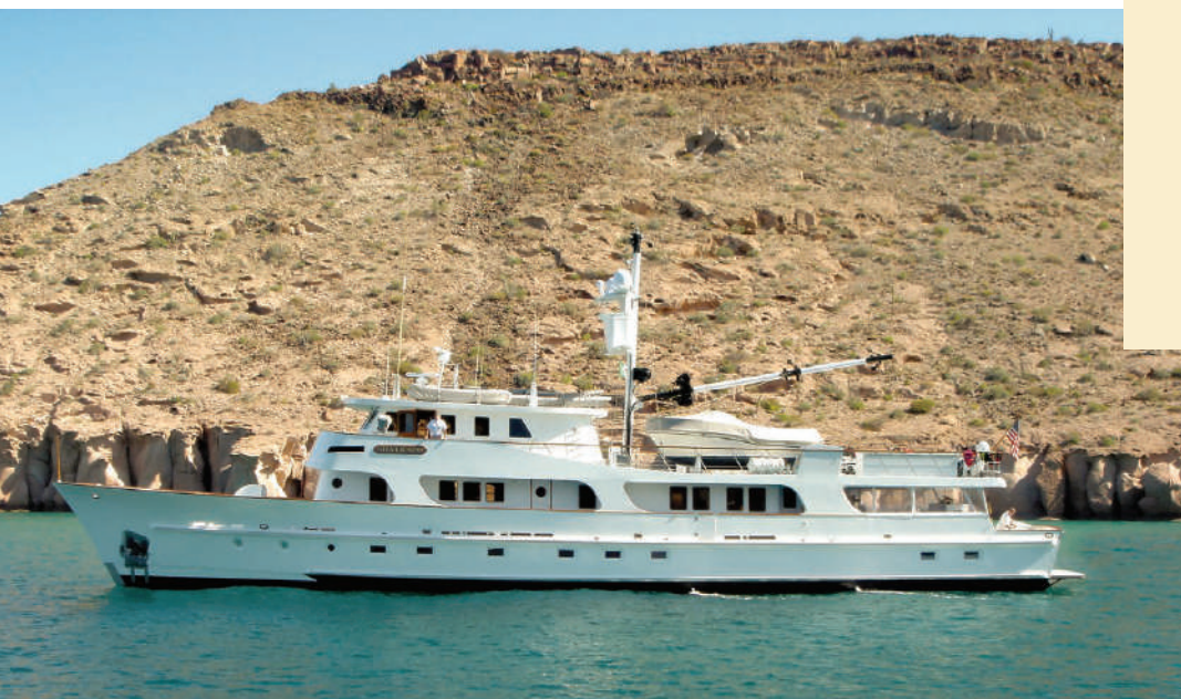
SILVERADO ANCHORED OFF THE SHORES OF MEXICO